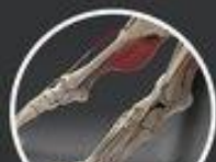
LEGS & FEET